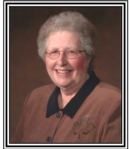
Mayor Coleen J. Seng