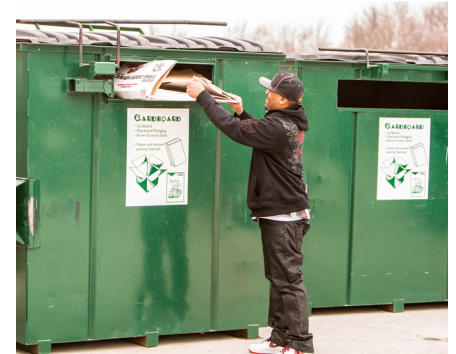
A resident recycles cardboard at one of the City's public recycling drop-off sites.

Please visit recycle.lincoln.ne.gov for additional educational materials and videos in multiple languages.