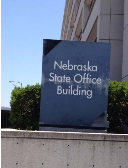
Existing, 14 th & M