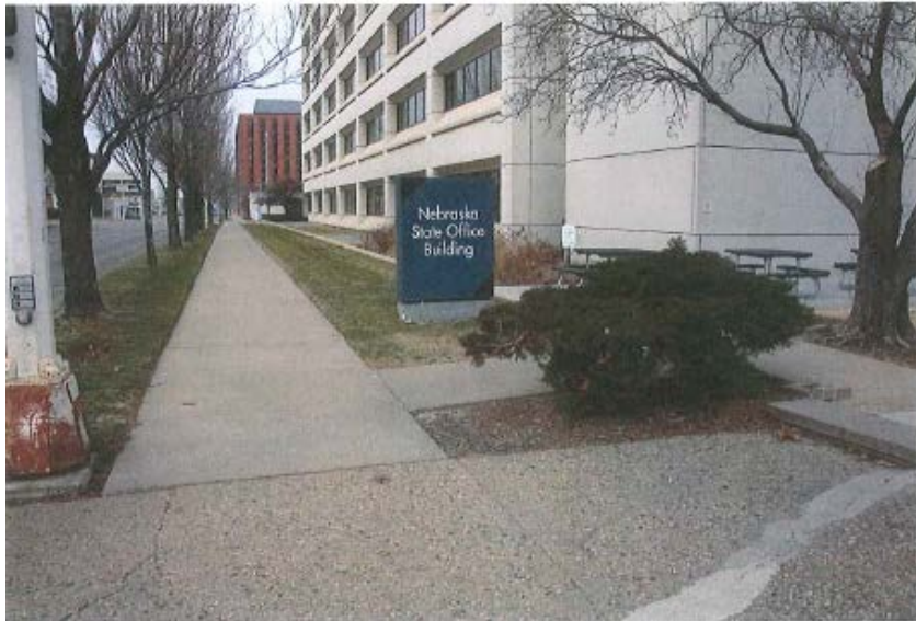
L St. at Centennial Mall (pre-rebuild of Mall)