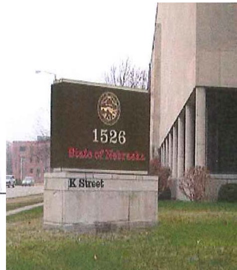
Existing, Northwest corner, 16 th & K