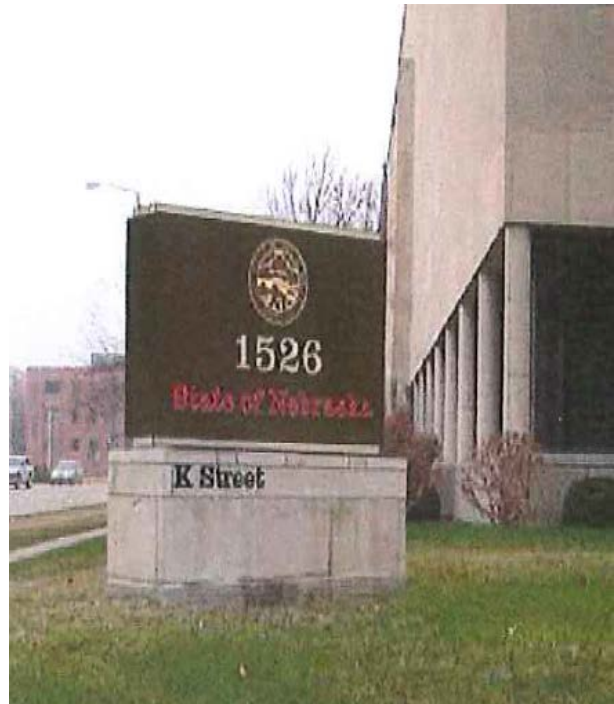
Northwest corner, 16 th & K

The proposed signs are very similar to the monument sign approved by the Commission for the “1526 Building” (former Woodman Accident) at the northwest corner of 16 th & K Streets.