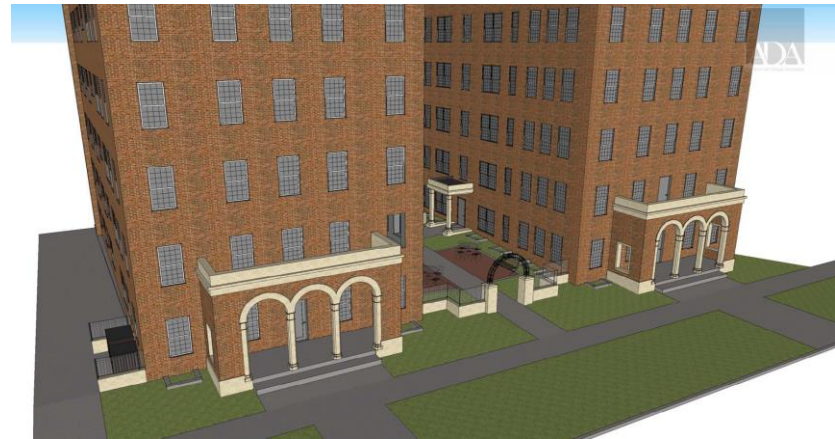
President & Ambassador Courtyard Proposal

Maintaining a variety of good quality housing units throughout the Environs District is among the goals of the Environs Commission.