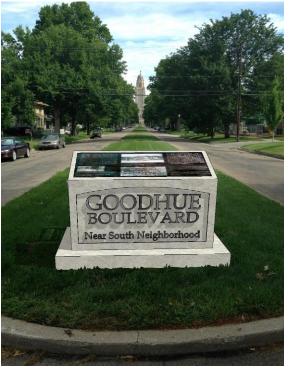
Goodhue Monument concept

Lincoln and to Nebraska. The overall concept was well received, with a spirited discussion of the optimal placement for the monument. The Association plans to return to the Commission in 2015 for further review and hopefully, approval.