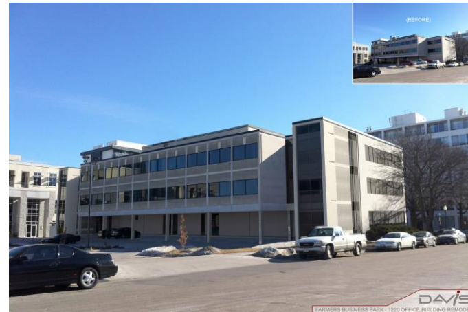
Approved Design from Northwest

Farmers Mutual Insurance Company followed up completion of its handsome new headquarters at South 13 th Street and Lincoln Mall with a plans to renovate the former headquarters at 1220 Lincoln Mall, which the Commission readily approved. The renovation includes windows in the formerly windowless east façade, providing outstanding Capitol views. The construction is now underway.