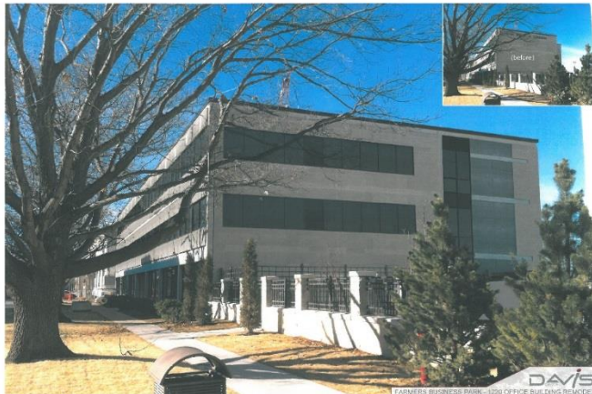
Approved Design from East