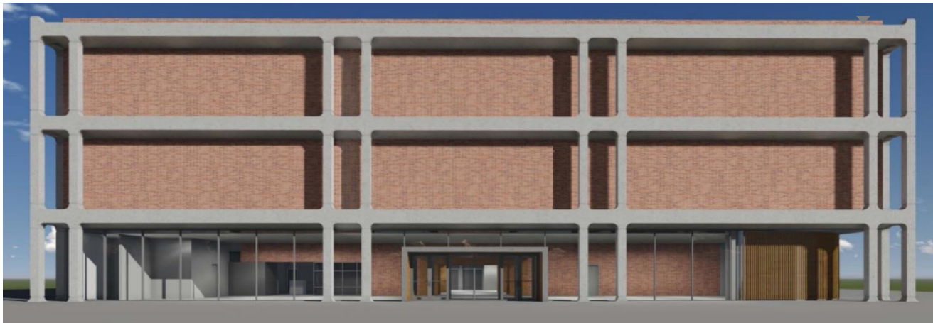
Approved Design from East

interior and mechanical systems, and also will create a welcoming new entry on Centennial Mall and an attractive new sign package.