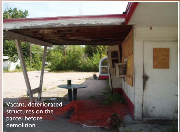
Vacant, deteriorated structures on the parcel before demolition