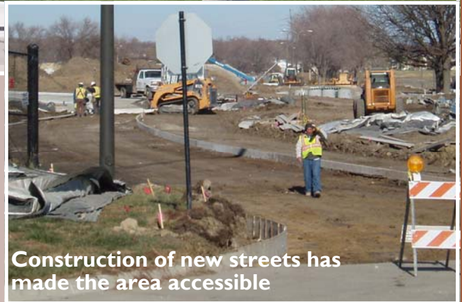
Construction of new streets has made the area accessible