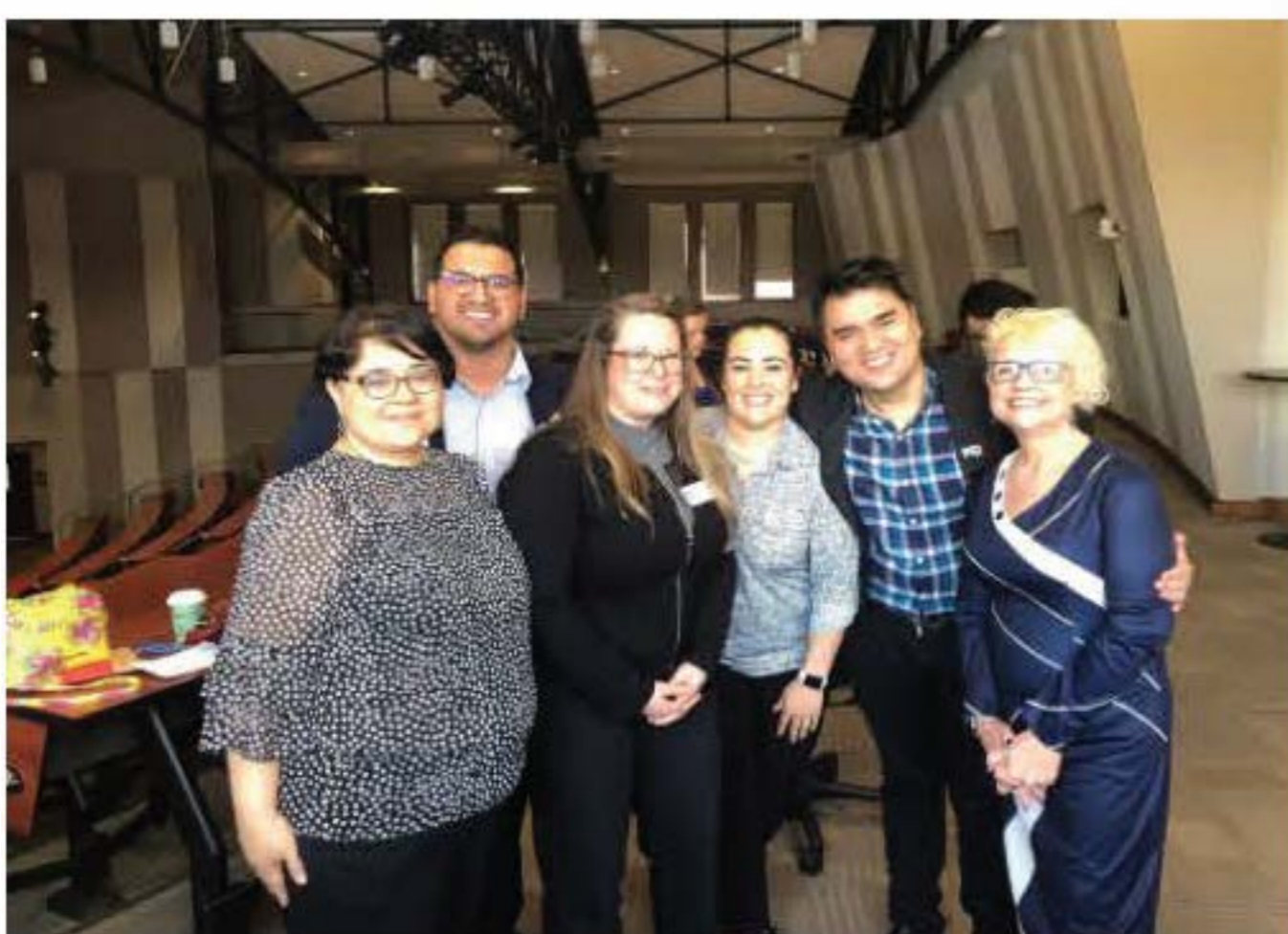
LCHR's 2019 Civil Rights Conference Keynote Speaker, Jose Antonio Vargas, poses with LCHR staff after a record-attendance conference.

LCHR provides community education and assistance to community groups, businesses, schools, and governmental entities for the purpose of providing education regarding our legal rights and responsibilities, as well as promoting diversity, equity and inclusion throughout our community.