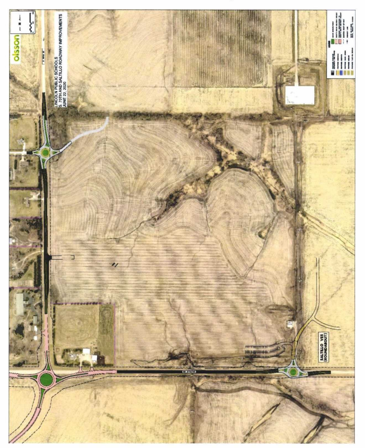
Exhibit "B" South 70th Street and Saltillo Road Improvements