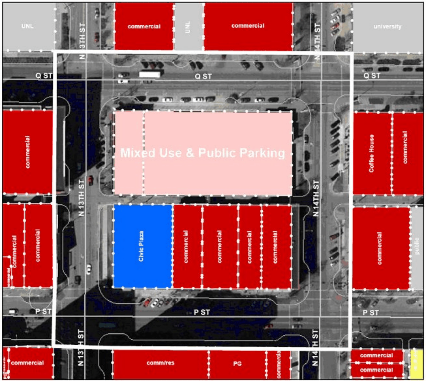
Exhibit IV - 163