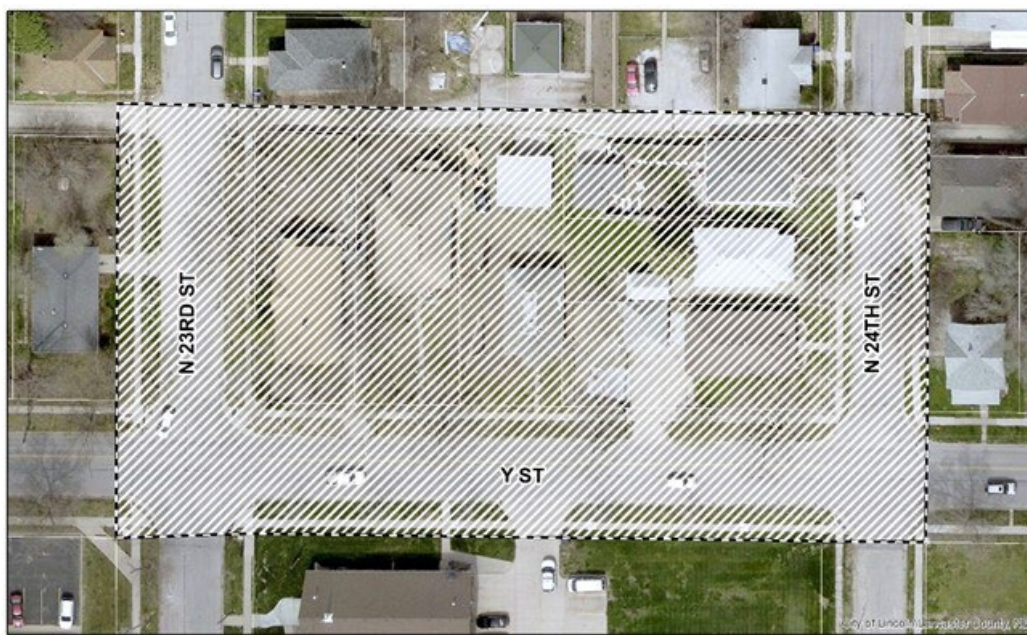
23rd & Y St Redevelopment: Project Area

The N. 23 rd Street and Y Street Redevelopment Project (the “Project”) includes the redevelopment of the southern portion of the block adjacent to the north of Y Street between N. 23 rd and N. 24 th Streets into an approximately thirty-six (36) unit multi-family housing apartment building including a number of affordable housing units. The Project Site is legally described as Lots 7 through 12 inclusive, Block 2, of Moores Subdivision of Lot 5 in the NE ¼ of Section 24, Township 10 Range 6, Lincoln, Lancaster County, Nebraska together adjacent rights of way (“Project Area”). The Project Area is depicted on the map, below: