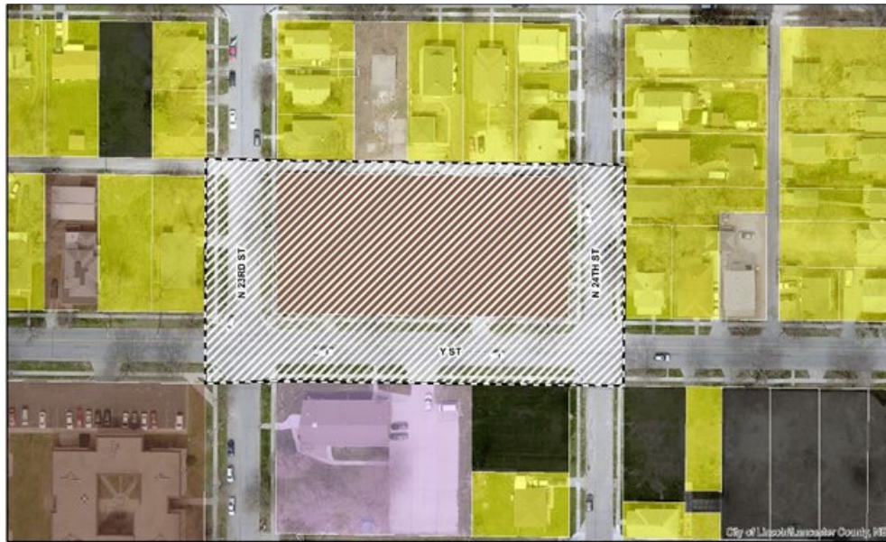
23rd & Y St Redevelopment: Future Land Use