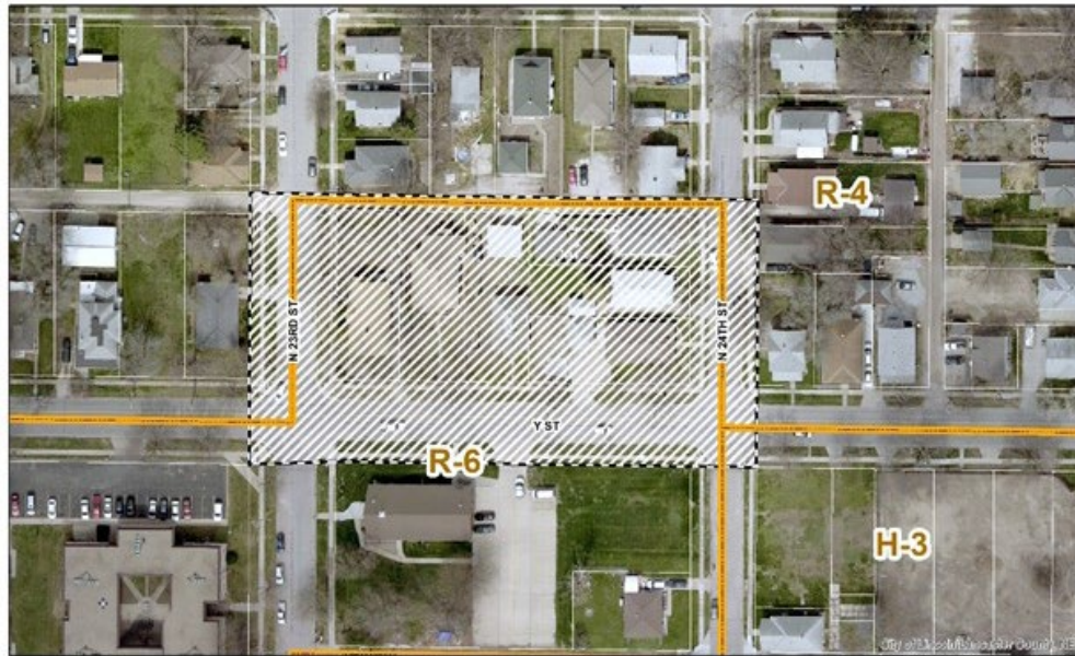
23rd & Y St Redevelopment: Future Zoning