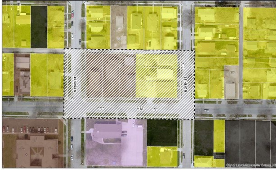
23rd & Y St Redevelopment: Current Land Use

Surrounding land uses are primarily residential with both single family residences and multi-family apartment buildings, in addition to some industrial and commercial uses. The Project's location along Y Street, between the N. 27 th street commercial corridor and the University of Nebraska-Lincoln's City campus, makes it an ideal location for redevelopment to higher density multi-family housing. See the Current Land Use Map and Future Land Use Map below.