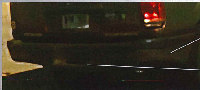
Separation wasn't there on July 31st