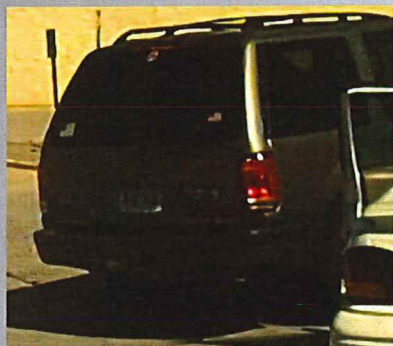
Left - Photo source is the police cruiser -

Along with State Farm, the Lincoln Police, and the NE State Insurance people have failed miserably ("Don't see where a crime was committed") I didn't "rear end" Preble's vehicle and cause $1000 worth of damage - I bumped his trailer hitch bar, causing ZERO damage - Here's proof -