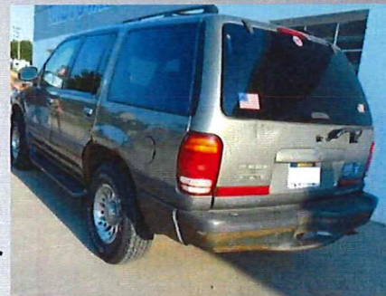
Right - Photo source is Preble's own camera - He messed up (sending State Farm this pic) - Shows damage that wasn't there until after July 31st (the date of our incident)