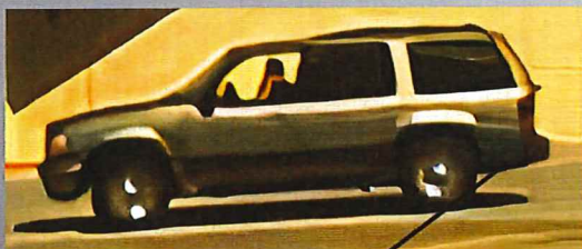
The only driver side picture I could get was as Preble was leaving - Lousy registration (no separation July 31st)