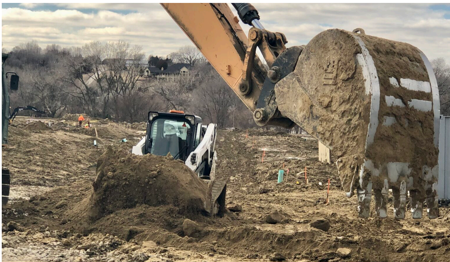
An affordable housing development in the Omaha area.