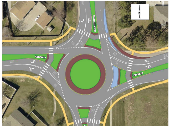
Proposed S. Coddington Ave. Roundabout