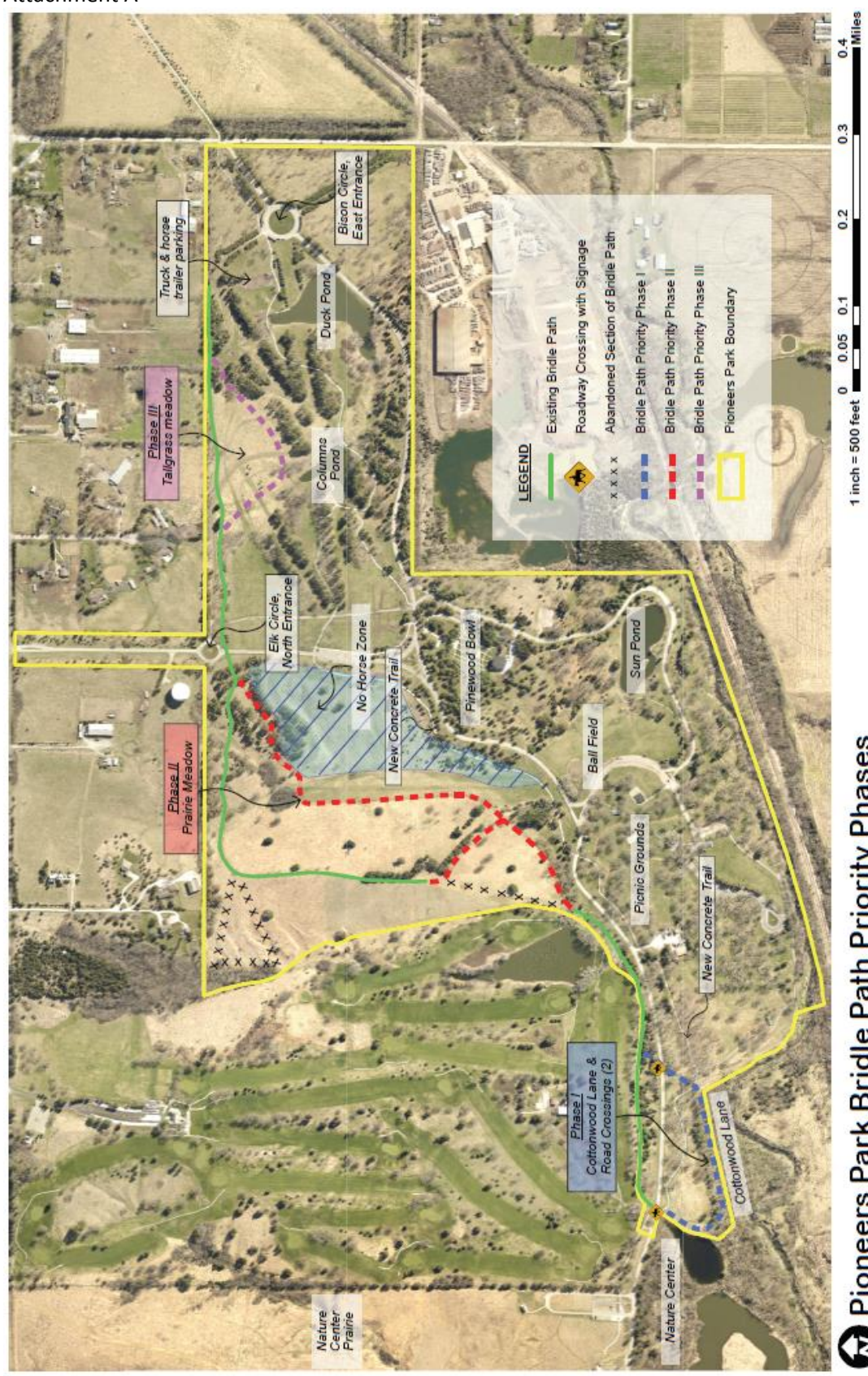
Pioneers Park Bridle Path Priority Phases