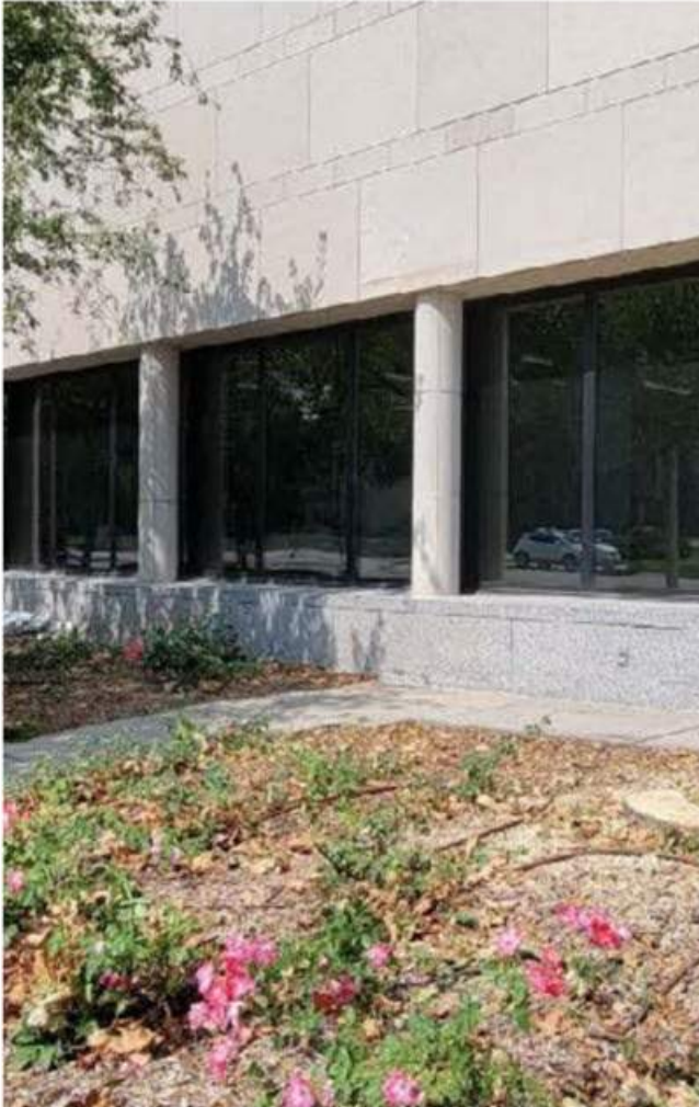
PRECEDENT: FIRST NEBRASKA ADMINISTRATIVE BUILDING

NATURAL STONE FACADE BASIS-OF-DESIGN: U.S. STONE INDUSTRIES COTTONWOOD HONED Estimated Project Cost: $6.556M