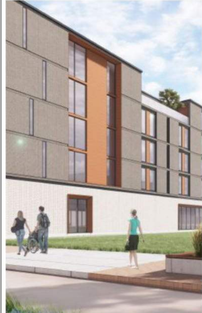
PRECEDENT: PERSHING BLOCK REDEVELOPMENT

HIGH-DENSITY RAINSCREEN CEMENTITIOUS PANEL FACADE BASIS-OF-DESIGN: NICHIHA ARCHITECTURALBLOCK GRAY Estimated Project Cost: $6.551M