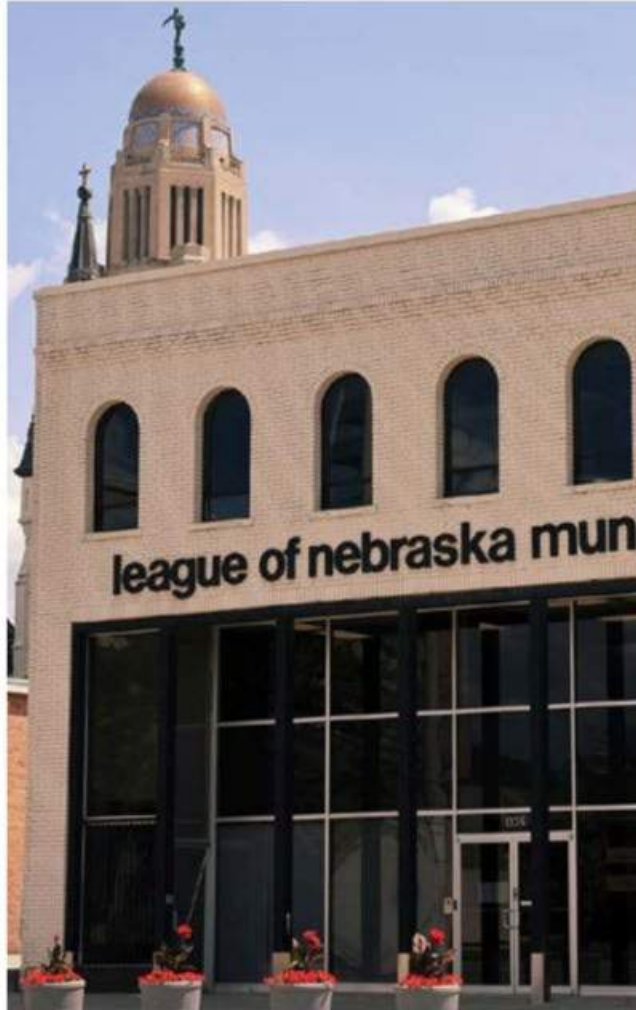
PRECEDENT: EXISTING LEAGUE OF NEBRASKA MUNICIPALITIES

BRICK FACADE BASIS-OF-DESIGN: GLEN-GERY CREAM WHITE WIRECUT Estimated Project Cost: $6.470M