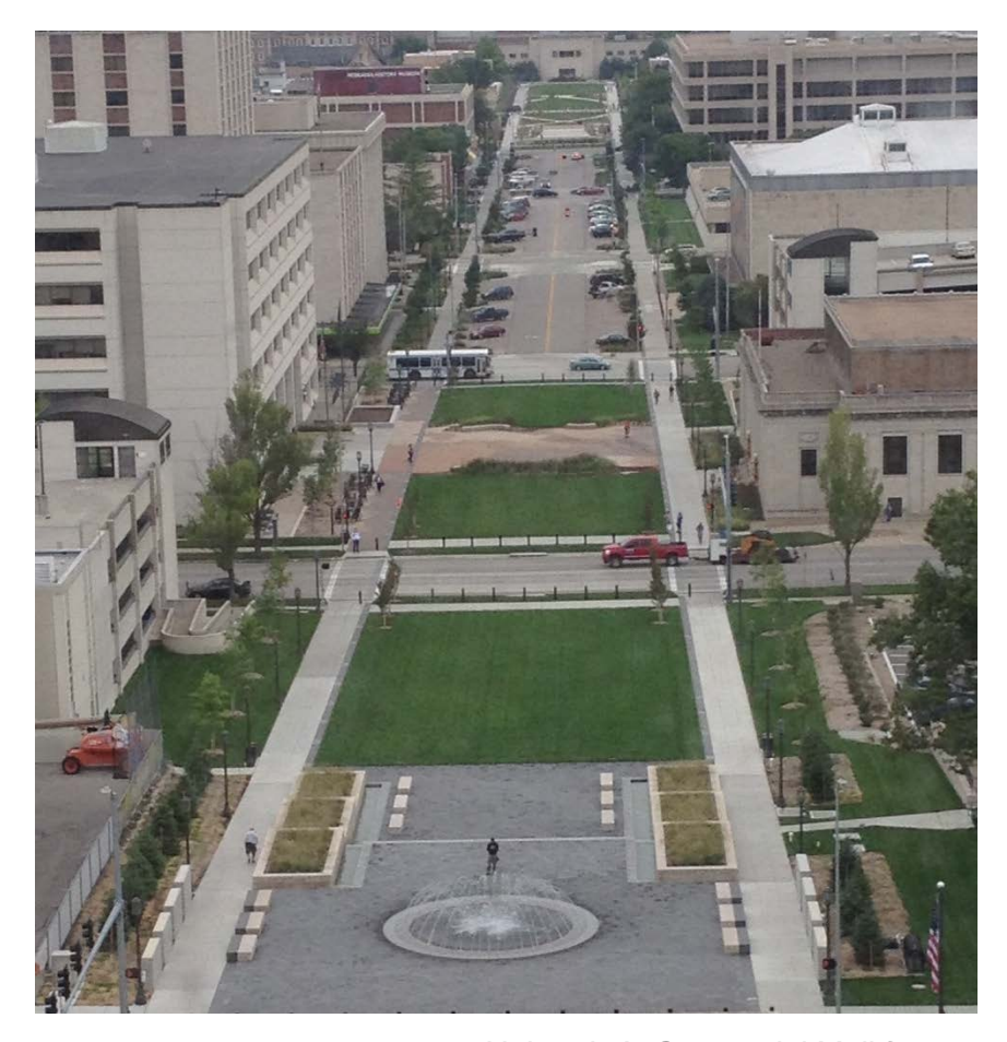
▲ Nebraska's Centennial Mall from the Capitol Tower, 2016

The Commission is required to meet at least quarterly by Section 27.56.060 of the Lincoln Municipal Code. The Commission has met nine times in 2016.