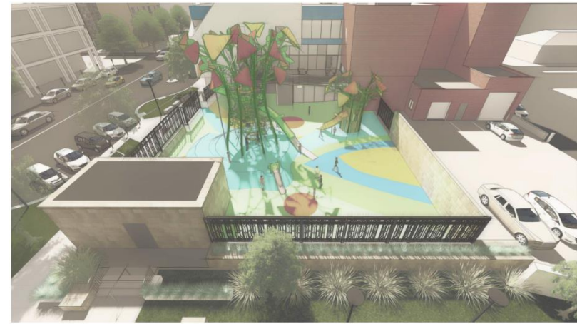
LCM East Lot | BIRDSYE 28 JUNE 2019 SCALE:1/4"