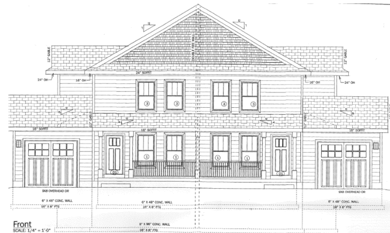
Front SCALE: 1/4" = 1'-0"