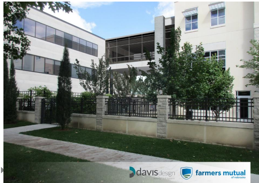
Design for Farmers Mutual skywalk on Lincoln Mall at South 13 th Street

In February, the Commission approved a skywalk link between the two Farmers Mutual buildings on their headquarters block on Lincoln Mall and South 13 th Street. Application for the building permit for the link was received in late October and construction has begun.