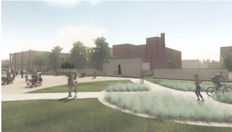
LCM East Lot | FUTURE SCREENING STUDY 28 JUNE 2019 SCALE:1/4"

In June, the Commission reviewed and approved updated concepts for an outdoor play area for Lincoln Children’s Museum at Centennial Mall and P Street.