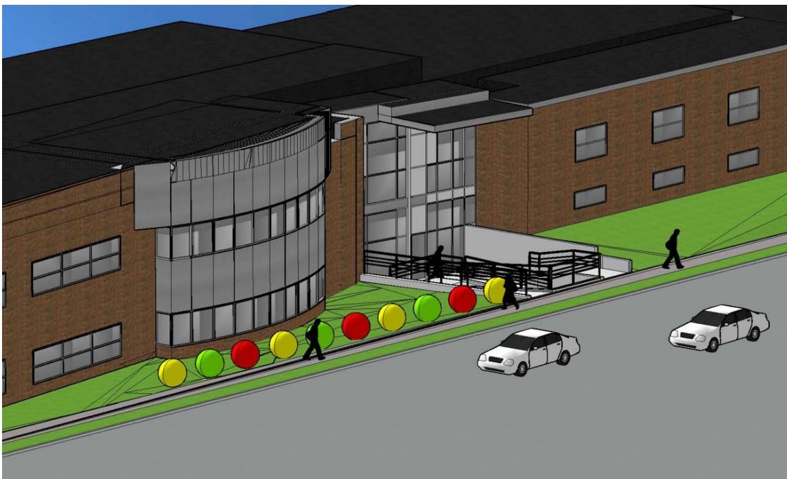
The perspective above shows the proposed traffic barriers to be placed north of the Community Action building at 1821/1843 K Street. The barrier colors shown on this illustration are just placeholders and do not represent the final color selection. Per the applicant, the intent is for the barriers to be “painted to simulate large marbles.”

Recommended Action: Approval of a Certificate of Appropriateness for the addition of vehicle barriers north of the Community Action building at 1821/1843 K Street.