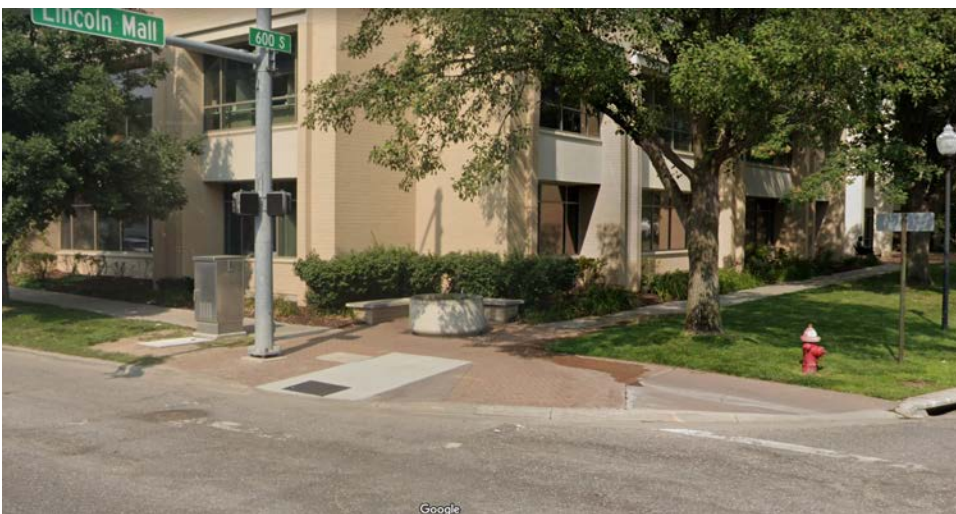
The top image above shows the two benches being targeted for removal at the SE corner of 1010 Lincoln Mall, while the bottom image shows the two benches at the SW corner.