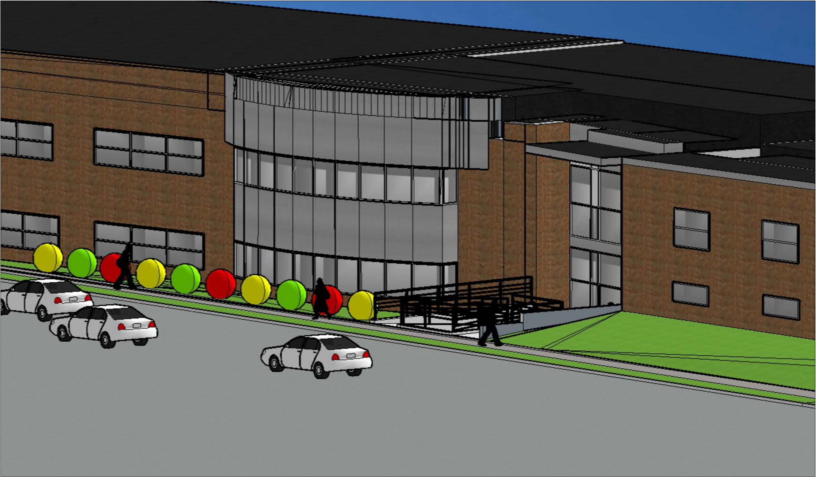
View From Northwest