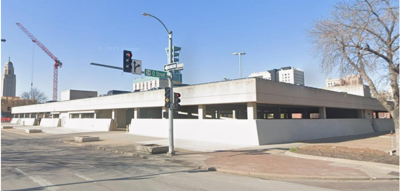
Google Maps view from S 16 th and O Street