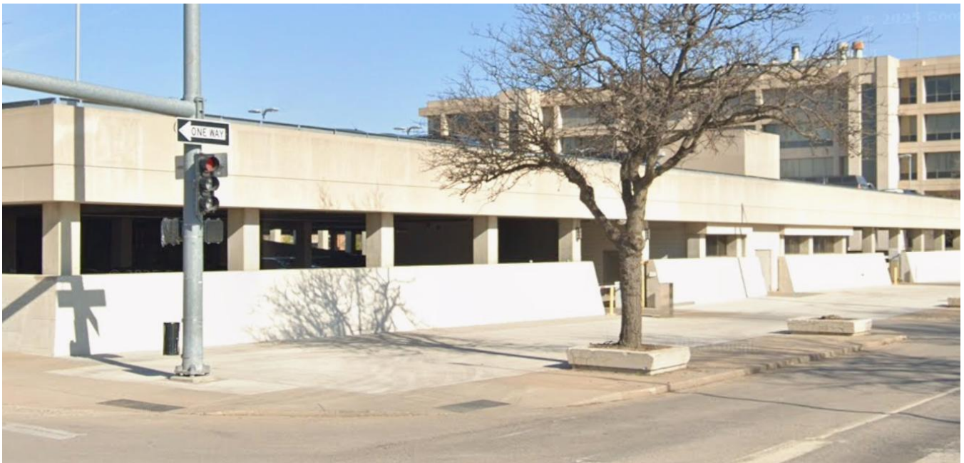
Google Maps view from S 16 th and N Street