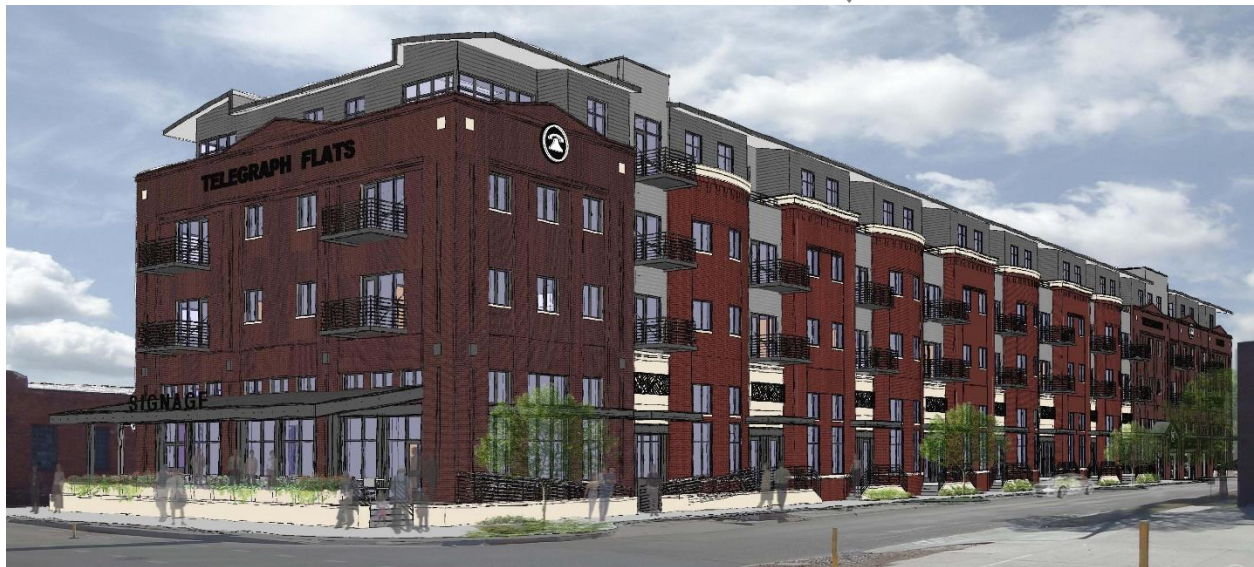
November Telegraph Flats Proposal

The Committee reviewed plans for screening of the LES substation at 21 st and N Streets at their November meeting. The design features a metal fence with design features at the corners and decorative fins repeating along the street-facing sides.