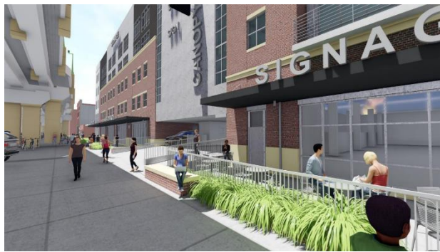
◀ Lumberworks Block, looking east on O St. from Canopy St.