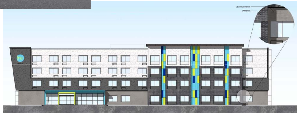
► Proposed Hotel

Advice was given on proposed redevelopment of the former Skate Zone property near 48 th and O Streets in September. The project will include a hotel on the 50 th Street side of the property and a stand-alone retail building on the 48 th Street side. The Committee's advice led developers to increase transparency of the 48 th Street frontage.