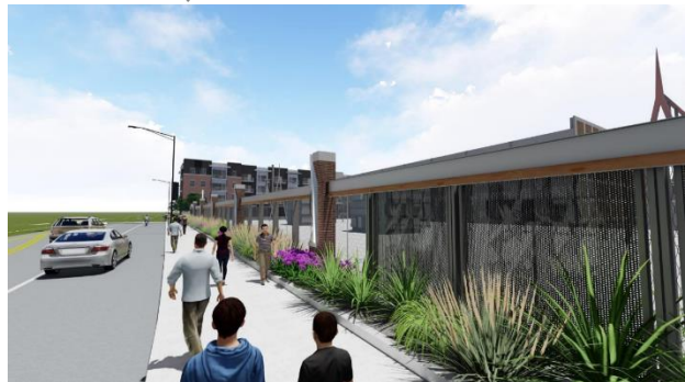
▼ Lumberworks Block, looking west on N St. from 8 th St.

“Lumberworks Block” is used to describe the block bounded by O, N, 8 th and Canopy Streets. The purpose of the project was to create a unified streetscape for the block that related to both Haymarket and West Haymarket. Screening of the LES substation is also included in the project as well as streetscapes adjacent to the Lumberworks Garage liner buildings, which are currently under construction.