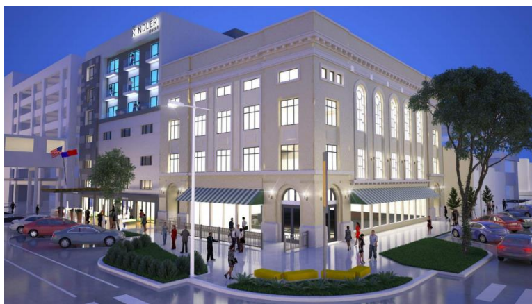
11 th & P Redevelopment

In January the Urban Design Committee advised on a redevelopment project at 11 th and P Streets that included the Lincoln Commercial Club building on the corner and the adjacent office building to the north. Together the buildings will be used for a hotel with associated event space, offices, and Misty’s restaurant. Construction is currently underway.