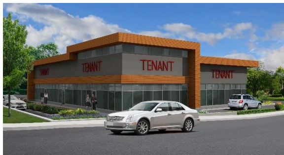
▲ Revised Design of Retail Building

Advice was given on proposed redevelopment of the former Skate Zone property near 48 th and O Streets in September. The project will include a hotel on the 50 th Street side of the property and a stand-alone retail building on the 48 th Street side. The Committee's advice led developers to increase transparency of the 48 th Street frontage.