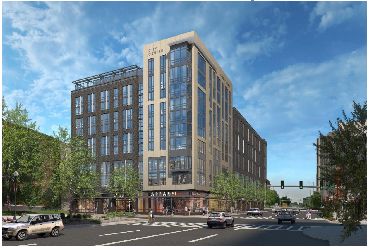
9 th & P Redevelopment, looking south on 9 th Street

Planned streetscape improvements for this project will extend the recent improvements on P Street from 11 th to 9 th Streets.