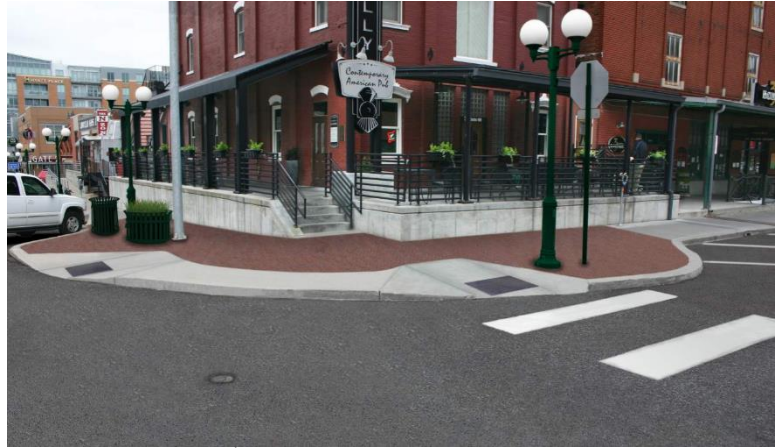
▲ Haymarket, 8 th and Q Streets

In Haymarket, bricks in the corner sidewalk nodes settled over time and were creating tripping hazards for pedestrians. This project will reconstruct those nodes to meet ADA and replace the bricks with pavers on a concrete base to reduce settling issues in the long term. The project will also include painting and replacement of street furniture and other fixtures within the district.