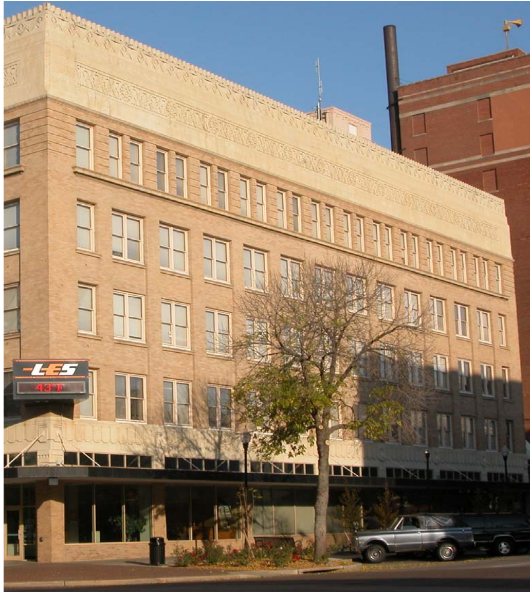
EXISTING EAST FACADE