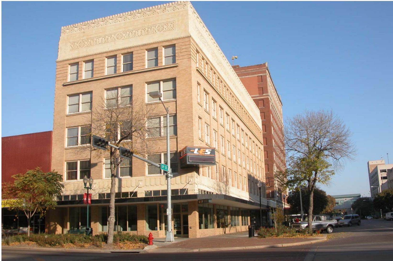
EXISTING SOUTH FACADE