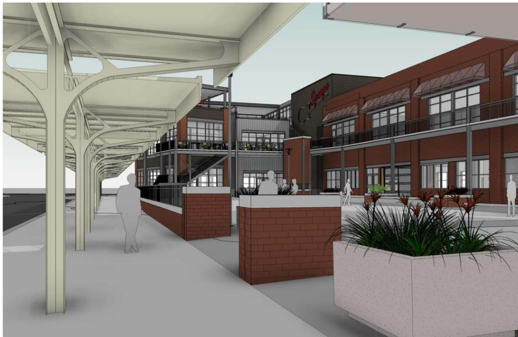
Proposed Canopy Street Development

The Committee's major contribution in 2012 continued to be providing public input into design aspects of the West Haymarket redevelopment. In January, February, and September, the Committee met jointly with Historic Preservation Commission for presentations and feedback on Lincoln Traction Partners' private development efforts and on the public streetscape master plan.