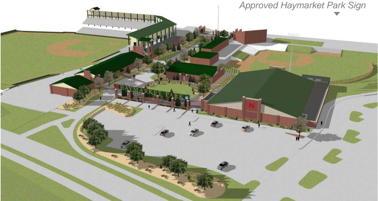
Approved Haymarket Park Sign

In February, the Committee also worked with the Saltdogs organization on a major identification sign for the sports complex, supporting an amendment to the Special Sign District.