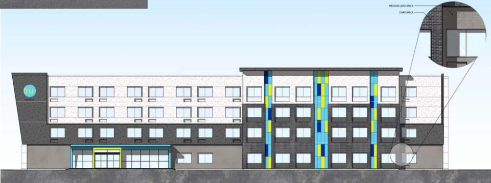
▶ Proposed Hotel

Advice was given on proposed redevelopment of the former Skate Zone property near 48 th and O Streets in September. The project will include a hotel on the 50 th Street side of the property and a stand-alone retail building on the 48 th Street side. The Committee’s advice led developers to increase transparency of the 48 th Street frontage.