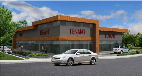
▲ Revised Design of Retail Building

Advice was given on proposed redevelopment of the former Skate Zone property near 48 th and O Streets in September. The project will include a hotel on the 50 th Street side of the property and a stand-alone retail building on the 48 th Street side. The Committee’s advice led developers to increase transparency of the 48 th Street frontage.