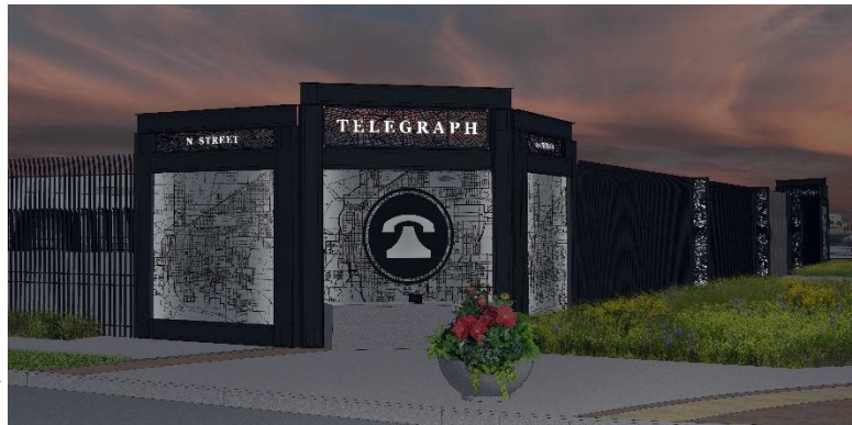
LES Screening ▶

The Committee reviewed plans for screening of the LES substation at 21 st and N Streets at their November meeting. The design features a metal fence with design features at the corners and decorative fins repeating along the street-facing sides.