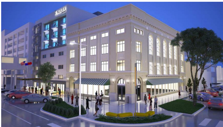
▲ 11 th & P Redevelopment