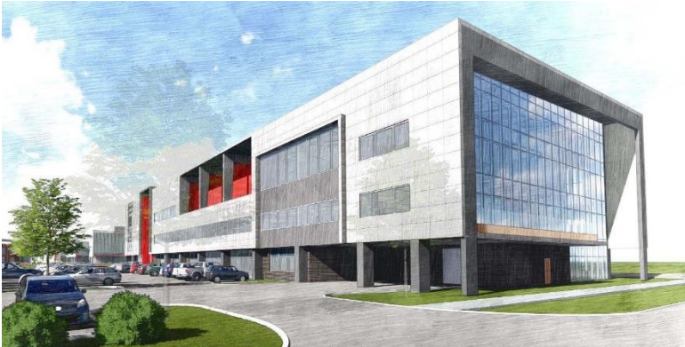
Proposed Phase 2 Building ▶

Phase 2 of Nebraska Innovation Campus redevelopment was brought to the Committee in March for a three story office building near the corner of 21 st Street and Transformation Drive. Developers have broken ground on the site and construction is underway.