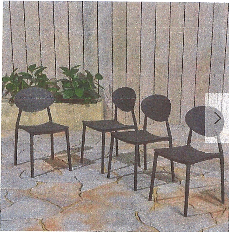
16 Black Dills Stacking Patio Dining Chairs made of plastic/resin