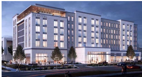
1. 2019 Proposal, looking southeast

The Committee recommended approval of another 6-story hotel proposal at Nebraska Innovation Campus in September 2019. Significant changes to the original proposal were reviewed by the Committee in February and March.