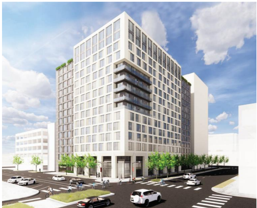
4. Block 65 Proposal, looking southwest

Plans for the streetscape were reviewed by the Committee in October.