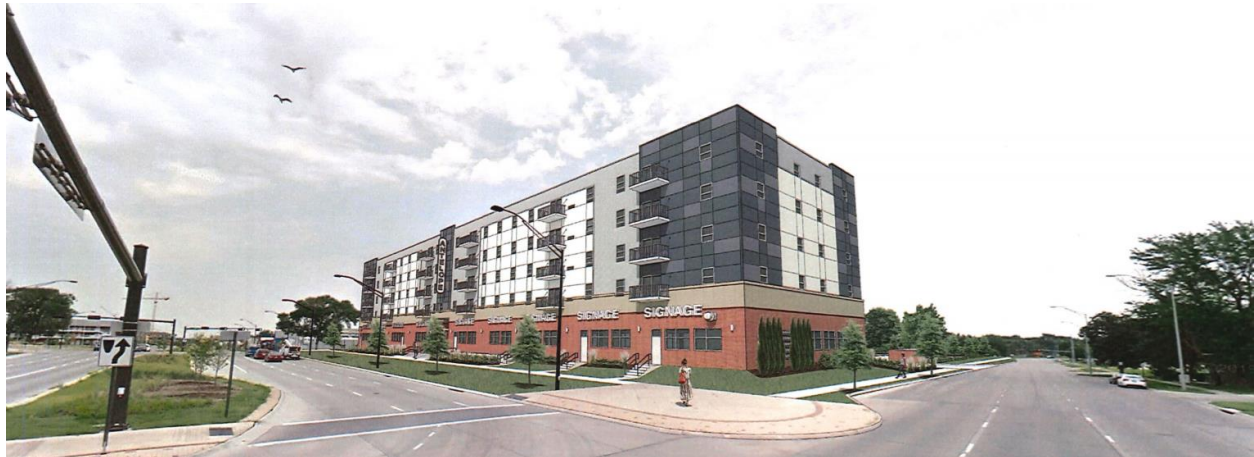
3. Antelope Tower Proposal, looking northeast

Urban Design Committee reviewed the proposal for this development along Antelope Valley Parkway. Reviews included plans for a five-story mixed-use building, along with landscape and streetscape improvements. Designs were reviewed by the Committee in March, April, and June.