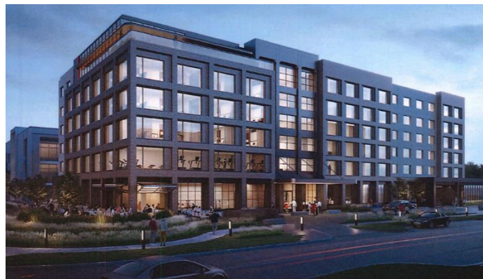
2. 2020 Design Revisions, looking southeast