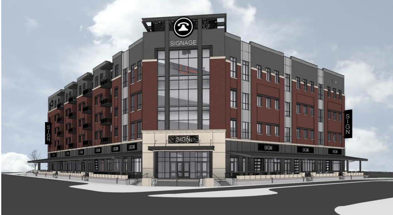
5. Telegraph Lofts West, looking southwest

UDC reviewed the next Telegraph District building at the southwest corner of 21 st and N Streets in October. It will be mixed use, with commercial on the ground floor and residential and office above. The building was found to meet the District's design standards.