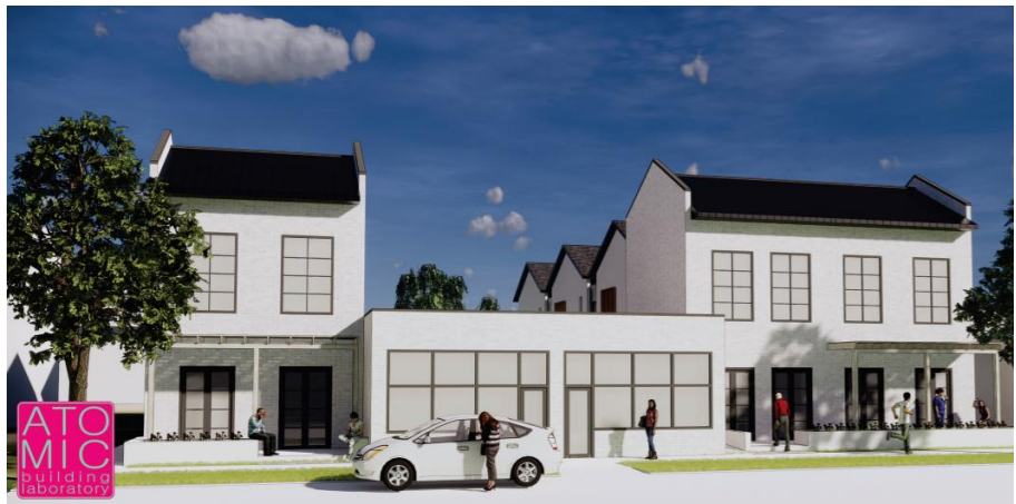
6. Proposal for 2236 R Street