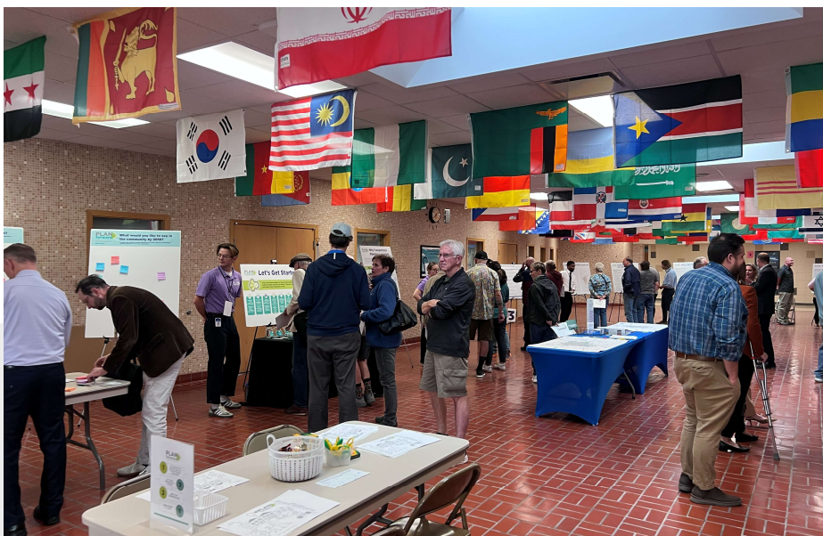
Oct. 23 Open House at Culler Middle School.

LTU Receives APWA Award for 17th Street Project