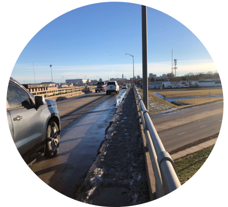
Pedestrian view from 14 th Street & Cornhusker Highway bridge.

Project design is slated to begin next year.