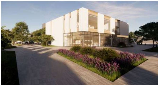
View of the MMTC at the preferred location.

Pre-award authority for the project has been granted by the Federal Transit Administration, allowing the City to move forward with land purchase. Construction bids are anticipated to go out in the Spring. Construction will occur during 2026 and 2027.