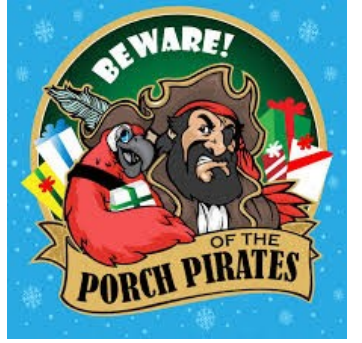
No Porch Pirates