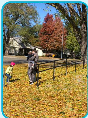
A family plays in the leaves after Toddler Time at Bethany Branch.