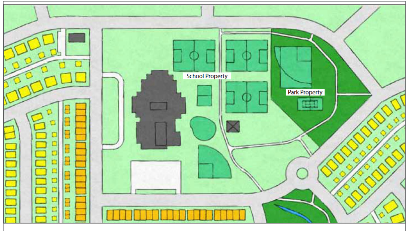
Figure 8.1: Joint School and Park Site ("Spark") Image

Park, and Adams Elementary and Folsom Park, park and school facilities are already located on adjoining properties. Schoo Middle School, which also has an adjoining YMCA, is the site of a planned neighborhood park. Wysong Elementary, being built between S. 56<sup>th</sup> and S. 70<sup>th</sup> Streets, north of Yankee Hill Road, will include a neighborhood park. Moore MIddle School is being built adjacent to Jensen Park and will also include a YMCA. There are opportunities to reduce costs for both parks, schools and the YMCA by sharing playgrounds, playfields and even using picnic shelters as outdoor classrooms. This relationship has not yet been formalized but shows great potential benefit for all organizations. The image displays how the joint school and park site ("spark") principles can work together in future neighborhoods.