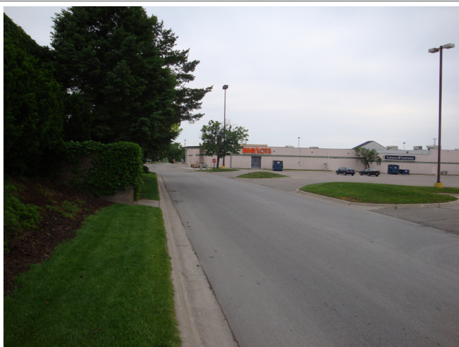
Figure 2.4: Present Day Photo, Looking West along P Street at about 68th Street

Transit enhancements will begin with increased level of service such as shorter wait times or longer service hours in key corridors. Identifying specific routes for express service is another likely strategy. As development intensifies along major corridors, such as O Street, perhaps in the next 24 years and perhaps later, bus rapid transit that interconnects with other routes could be introduced.