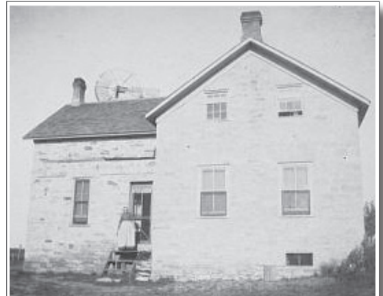
The Krull house was built in the 1860s in Lancaster County between Roca and Sprague.

Vision and is to be considered as the Plan's policies and programs are implemented.