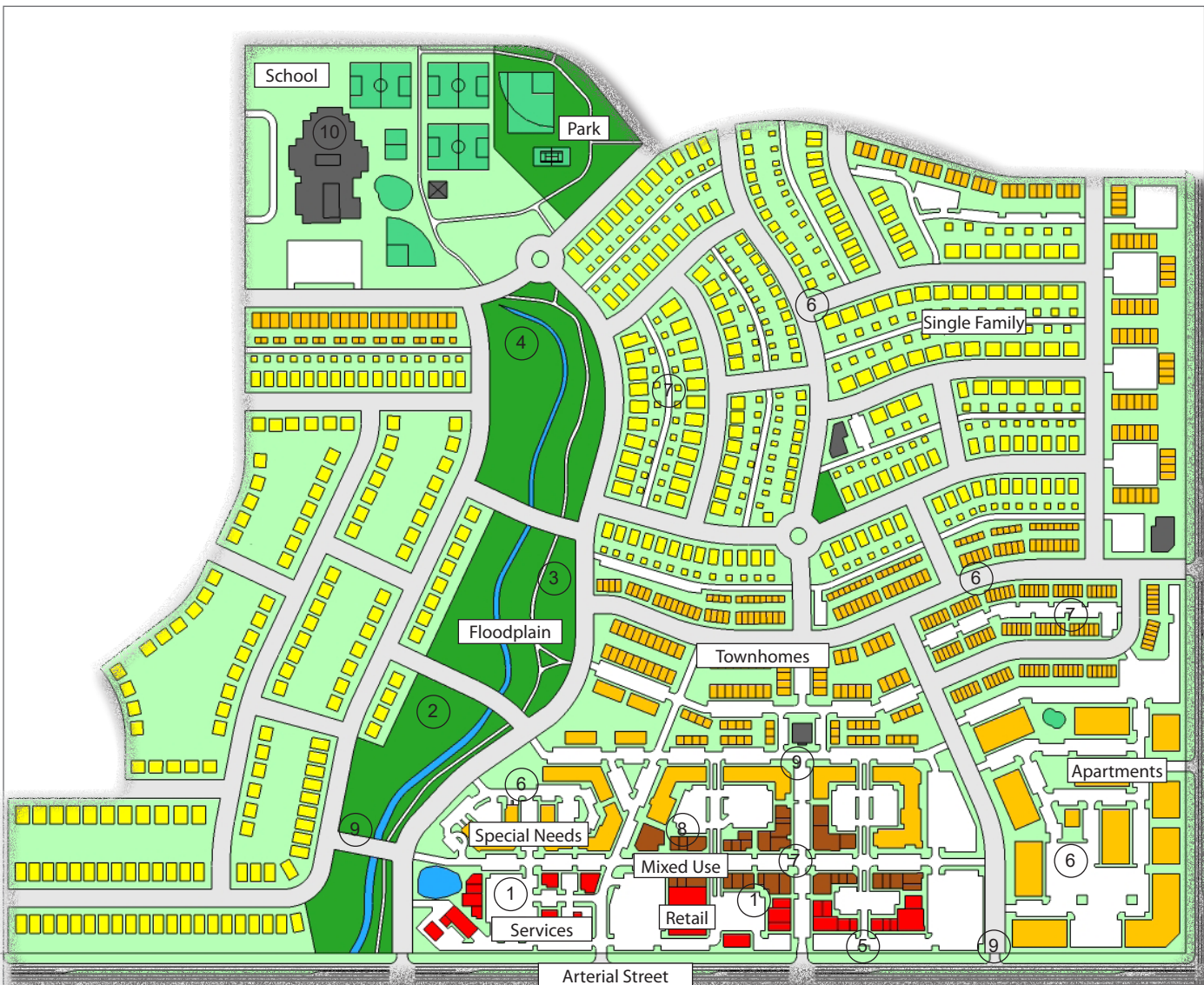
Figure 2.3: Community Form Diagram