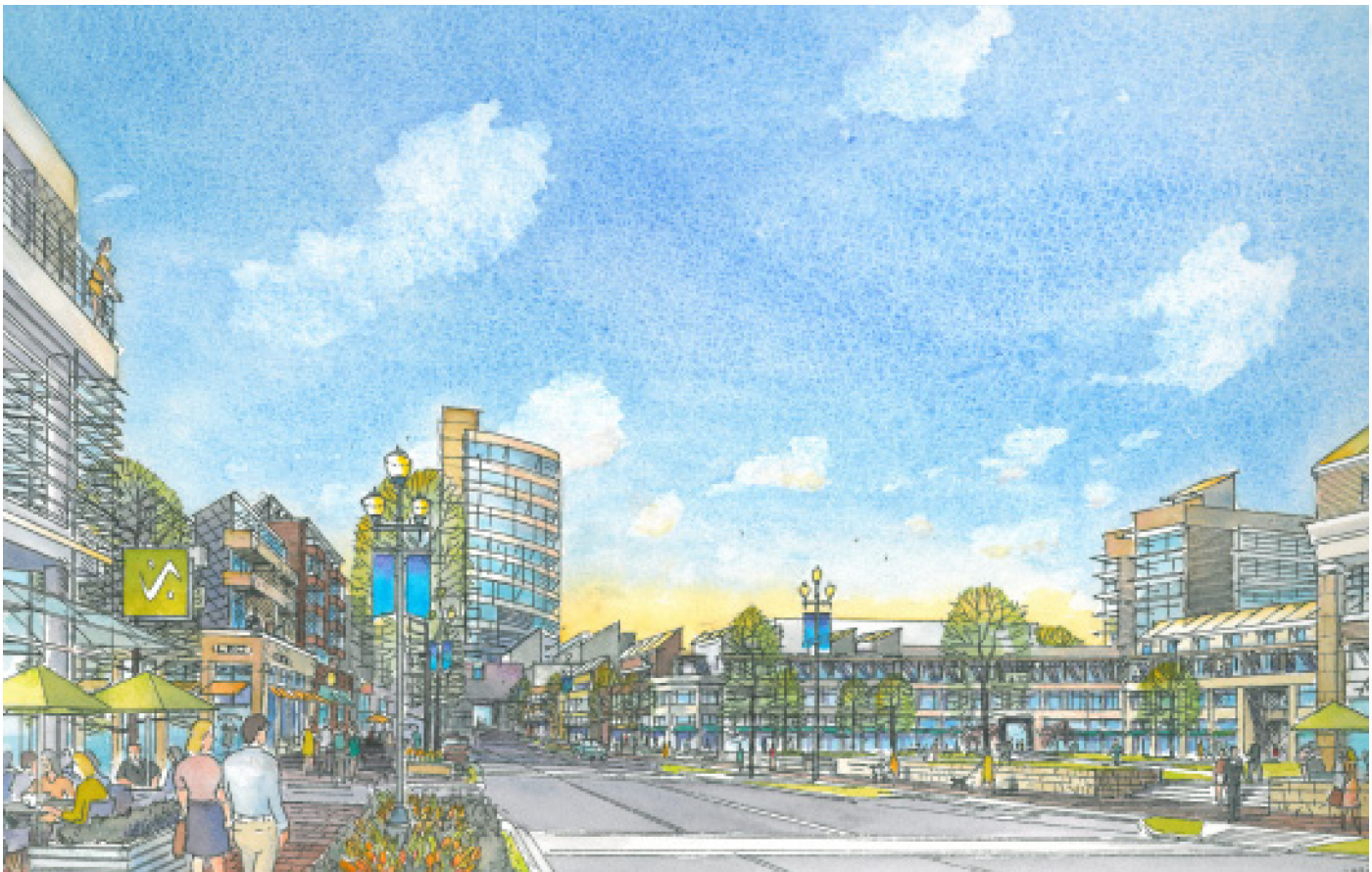
Figure 2.5: An architect's depiction of the Mixed Use Redevelopment Nodes and Corridors Concept, Looking West along P Street at about 68th Street