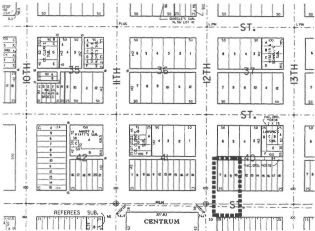
Exhibit IV-43 Existing Plat Map

■■■■■ Sub-Project Boundary -- Centerstone