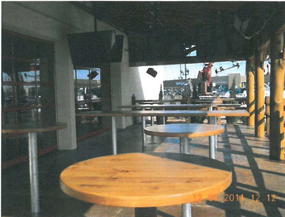
Exterior Tables Tops (Option 1)

(8 th St.) side, which is on vacated former right-of-way, hence no city permit is required for the proposed use of that area.