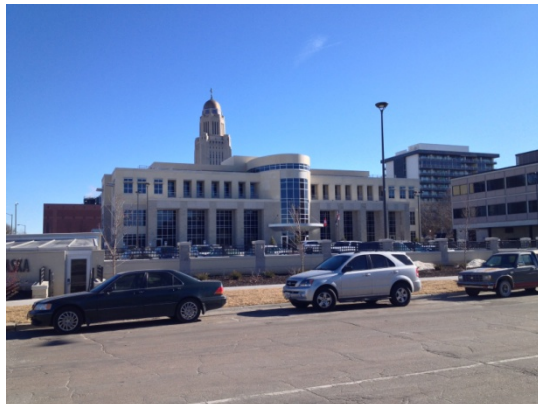
View from West ▼