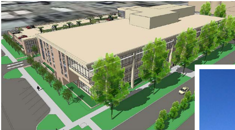
Approved Design View from Southwest

11 th Street, but will have structured parking on the north half of the block, rather than surface parking. The commencement of this project eliminated the last surface parking lot along Lincoln Mall and will replace it with another high quality urban building.