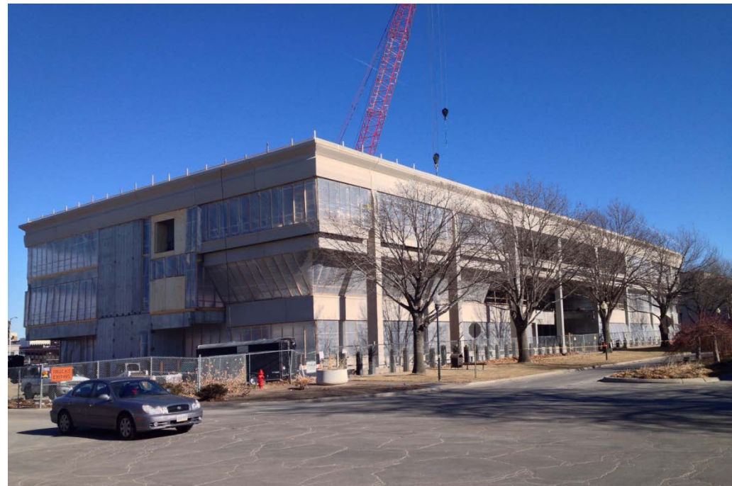
Photo of Construction Progress, Fall 2013